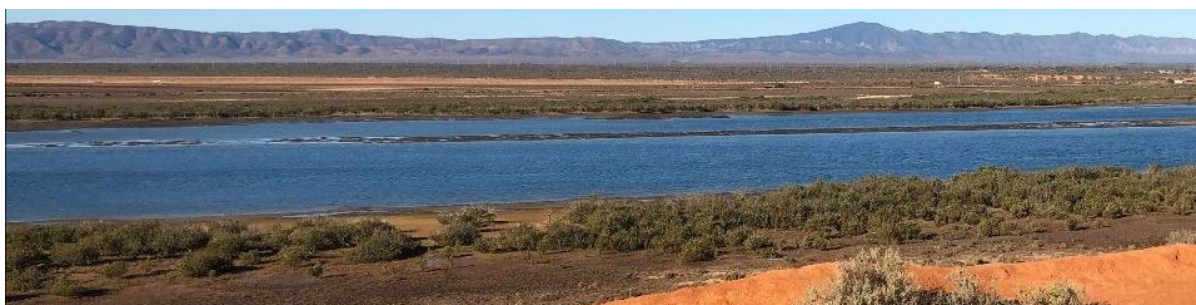
Port Augusta, South Australia