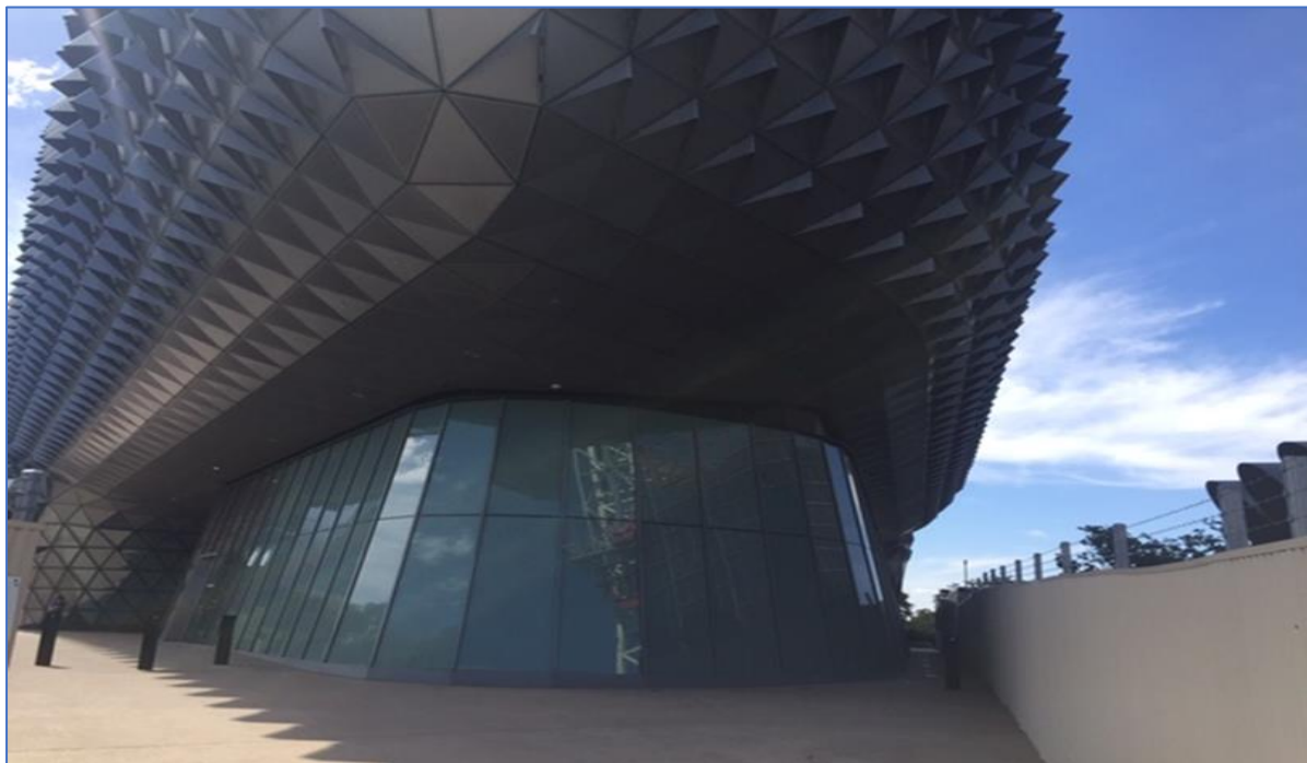
Location of the SAHMRI Indigenous STEMM Mural

Located between the Royal Adelaide Hospital and the new Bragg Comprehensive Cancer Centre, SAHMRI is highly visible to foot, automobile and tram traffic on North Terrace, and to pedestrians travelling through the biomedical precinct. The mural will be located at ground level on the south-western corner of the SAHMRI building. Displayed over 24 glass panels (two rows of 12 panels stacked on top of one another), the mural will be a high-impact focal point of the precinct.