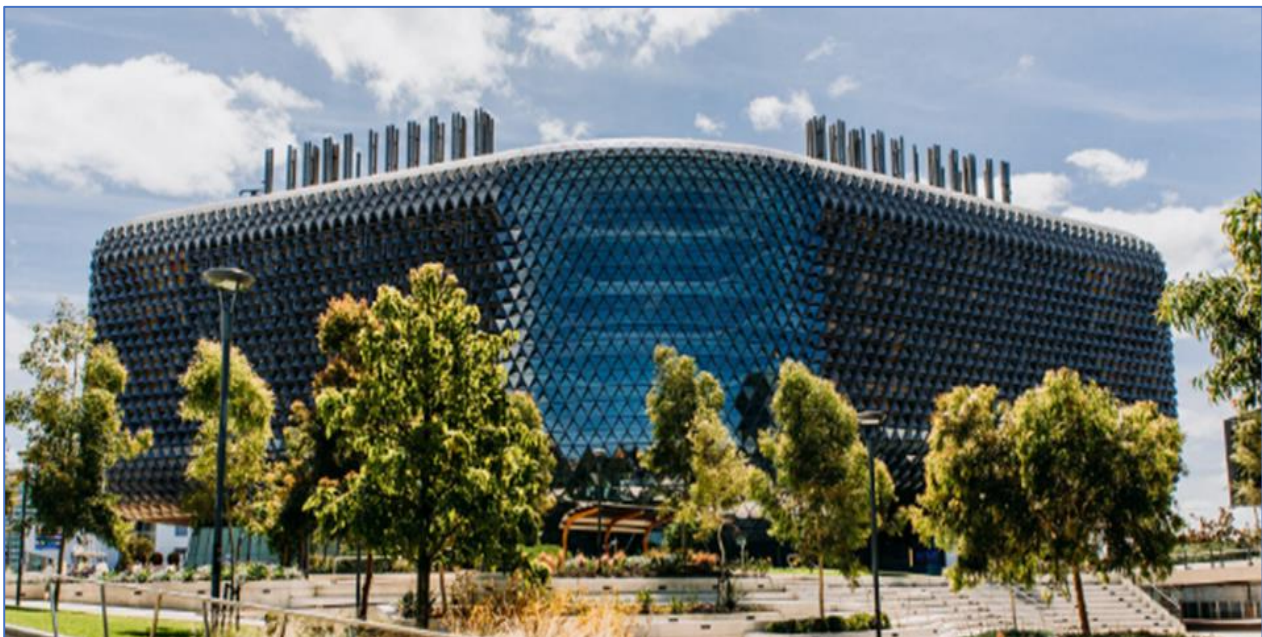
Image of the South Australian Health & Medical Research Institute (SAHMRI)

The field of STEMM has historically had low representation of Aboriginal, female, non-English speaking and non-binary workers. SAHMRI works actively to encourage a diverse and inclusive workforce.