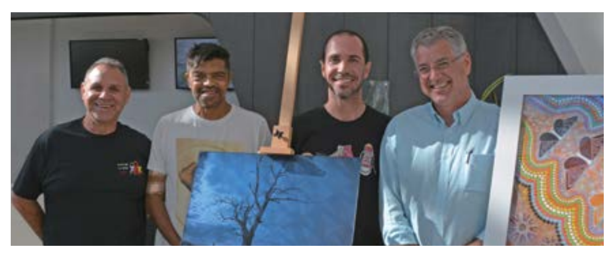
\ensuremath{^*\text{permission}} has been sought from the Fazulla family to utilise this image